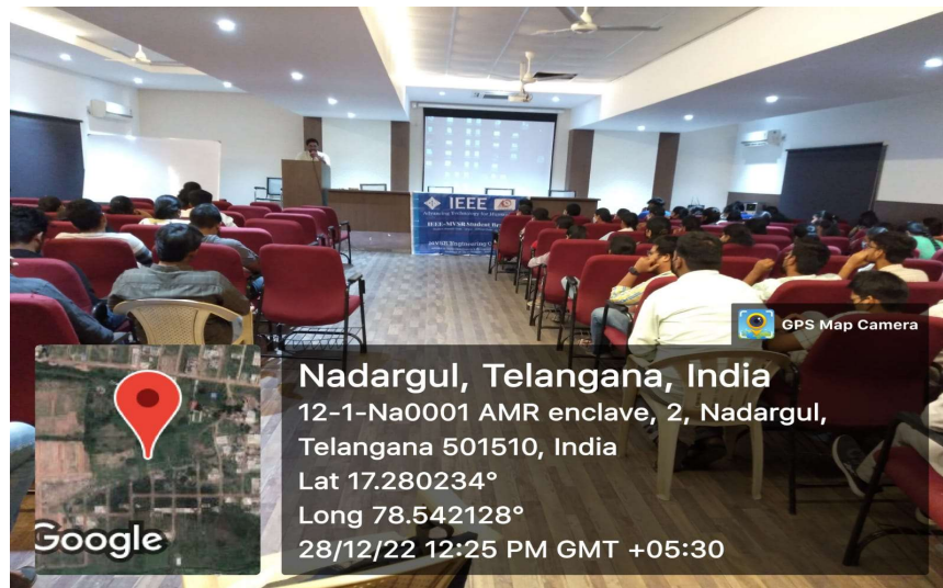
Speaker representing his ideas

The key points involved in the lecture were :